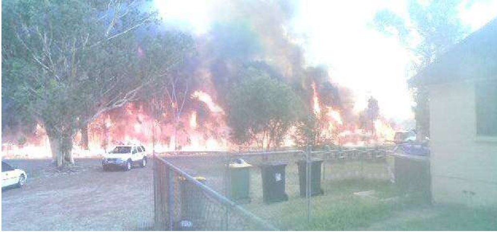
The View from Fays house

The Rural Fire Services saying 15 homes in Londonderry are now under direct threat, with some cars and trucks already burnt out on rural properties, residents are staying with their homes and battling to save them.