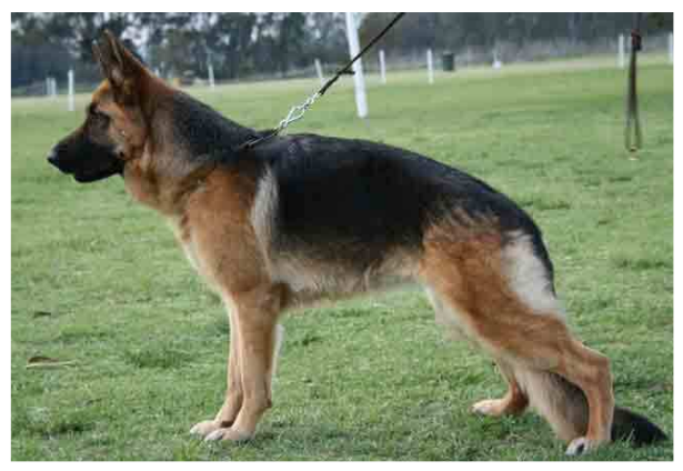
MINOR PUPPY BITCH SUNHAZE COCOA POP