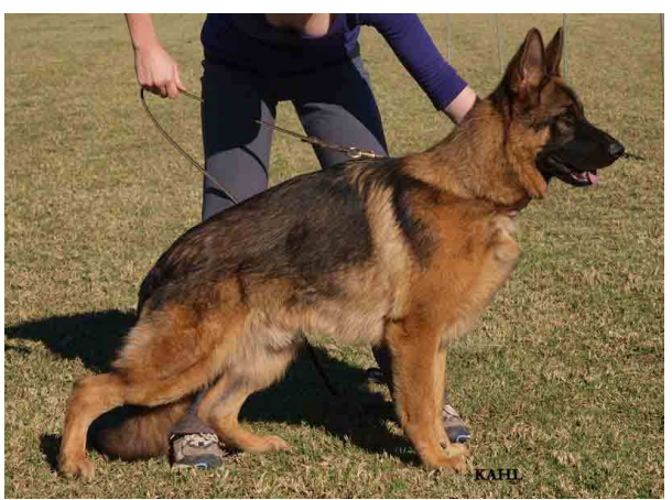
PUPPY DOG CONKASHA QUANTAM RAIDER