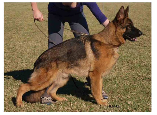
PUPPY DOG FREEVALE CAUSIN CAYOS