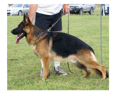
<u>PUPPY DOG</u> Durnstein Captain Kirk

<u>JUNIOR DOG</u> Freemont Too Hot To Handle AZ