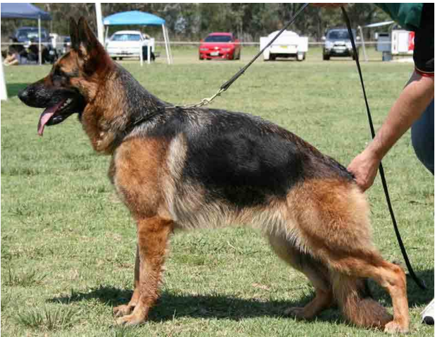
PUPPY BITCH KIRCHBERG ACUTE BEAUTY