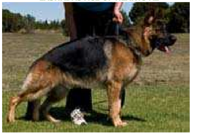
JUNIOR DOG SCHNEEBERG FIRE STORM AZ