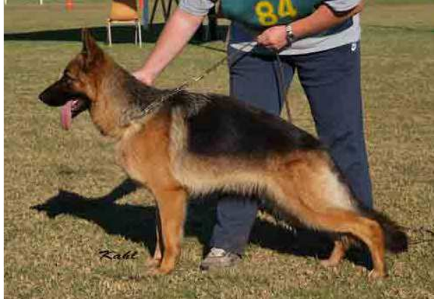
JUNIOR BITCH SUNHAZE INTEGRITY AZ