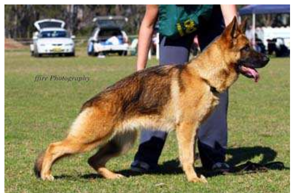
Bemboka Inner Star