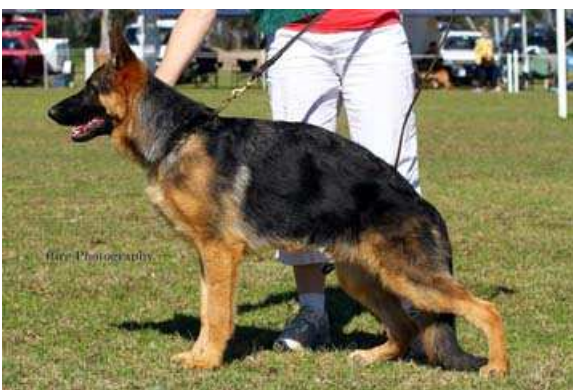
Sundaneka Yogi Bear