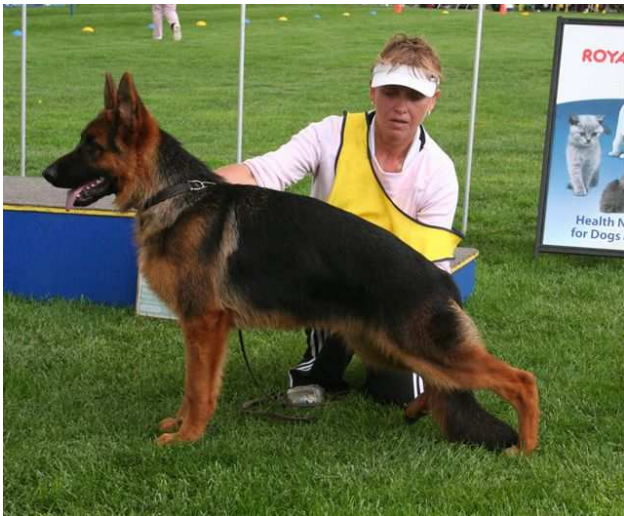
BABY PUPPY DOG