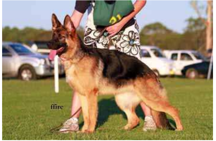
MINOR PUPPY BITCH