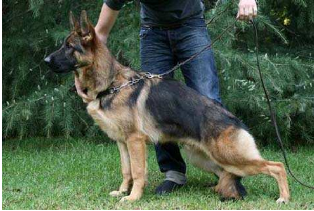
MINOR PUPPY DOG Zandrac Boy From The Bush