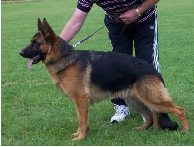
MINOR PUPPY DOG