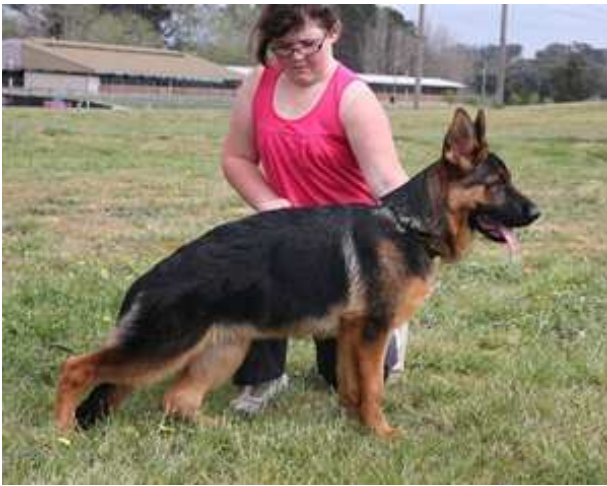
BABY PUPPY DOG