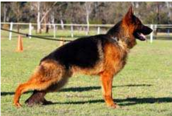
Andacht Raz N Hell