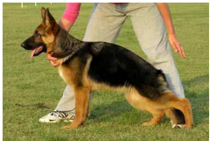
BABY PUPPY BITCH