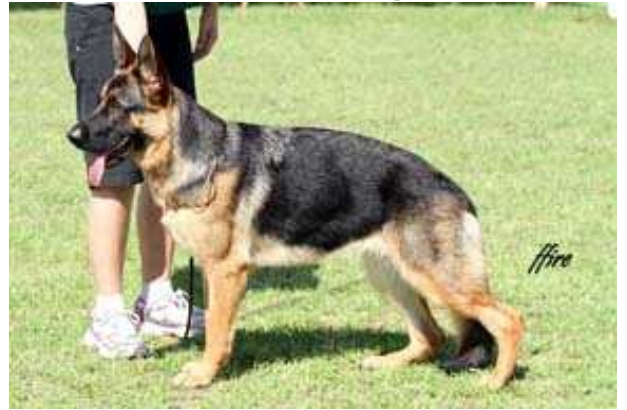
MINOR PUPPY BITCH Durnstein Dirty Dancing