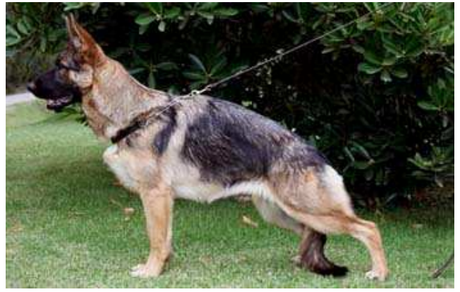
MINOR PUPPY BITCH