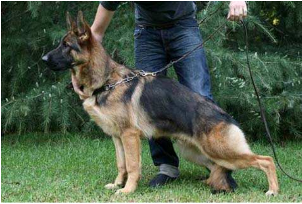
MINOR PUPPY DOG