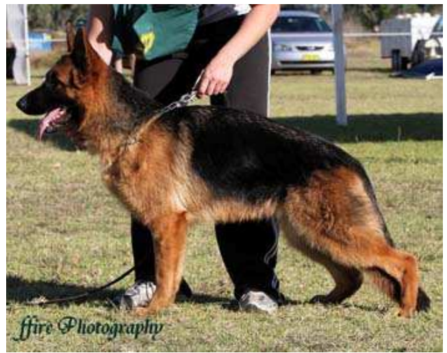
BABY PUPPY BITCH