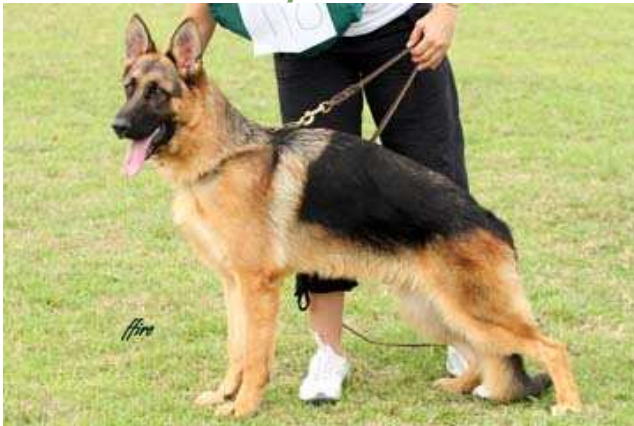
BABY PUPPY DOG Andacht Raz N Hell