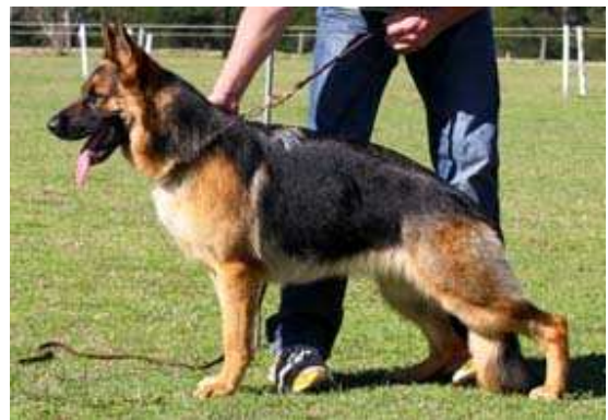
Jonkahra Simply Irresistible