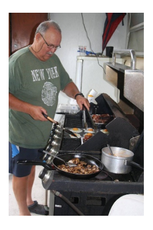
Full Christmas breakfast for 15 please

It is particularly gratifying to us all as an entire group when one member enjoys a success, even more so if the team en masse has a good day. Likewise we are there to support each other when puppies