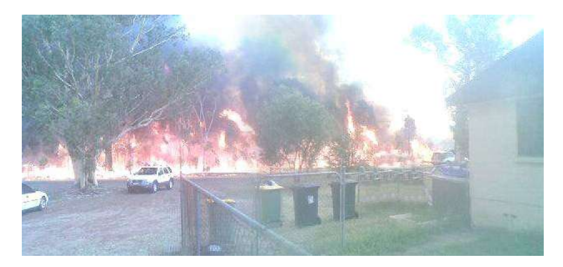
The View from Fays house

The Rural Fire Services saying 15 homes in Londonderry are now under direct threat, with some cars and trucks already burnt out on rural properties, residents are staying with their homes and battling to save them.