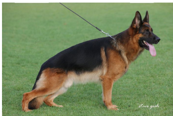
2017 Seiger – Djambo vom Fichtenschlag Owned by Hetty Choy