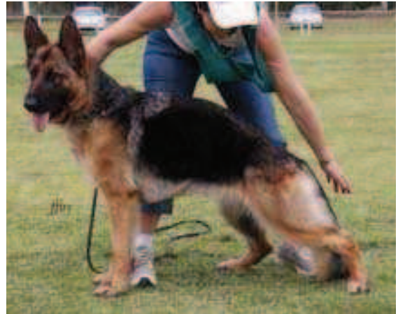
Junior Bitch Sundaneka Okina