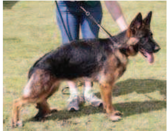
MINOR PUPPY BITCH Sundaneka Safari Queen