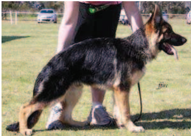
BABY PUPPY DOG Treuschutzer Cautin The Act