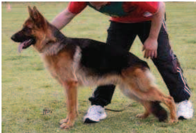
PUPPY DOG Freevale Nothing Too Serious