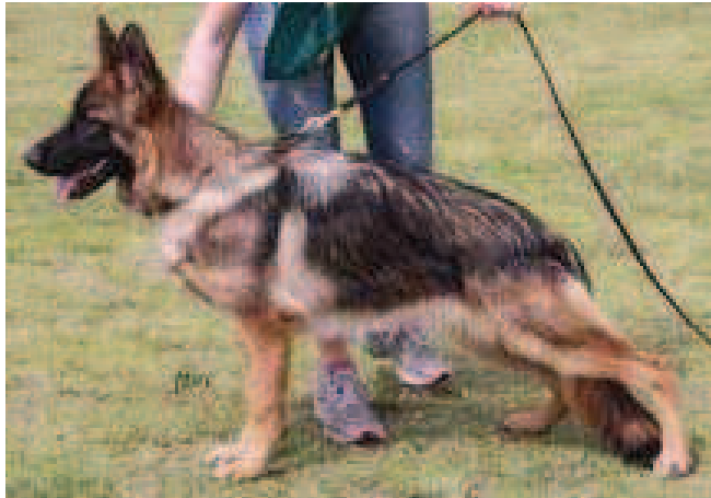
MINOR PUPPY DOG Schneeberg Ultiately Kryptic