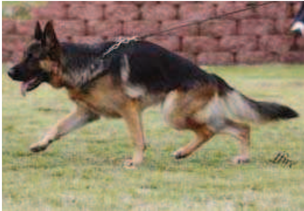
Junior Dog Siobahn Kentucky AZ