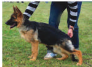
Flora vom Tatzend