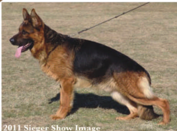
2011 Sieger Show Image

a-normal ED-normal HDZW-73 Kkl I AD BH SchHIII DNA