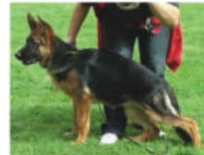
Jalka vom Schenken Ländchen