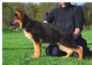
VV1 Di Di vom Valtenberg