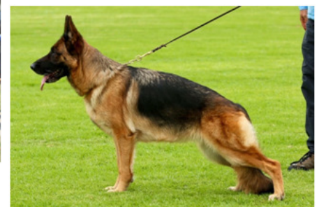
Gold Medal Female, beautiful ZICKE VOM FEUERMELEDER, dam of both stock coat baby class winners.