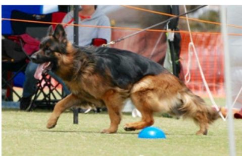
Gold Medal LSH Male Ch EROICA CATCH ME IF YOU CAN