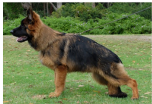
1st Baby LSH Dog Siobahn Greyt Impact