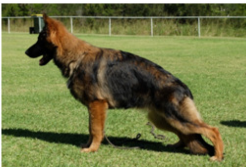
1st Baby LSH Bitch Siobahn Greyt Temptation

Early morning rises, hot sun, and substantial classes of quality dogs were the hallmark for the next three days.