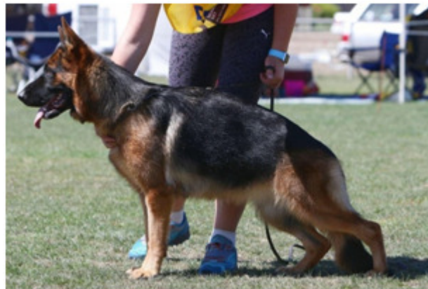
1st Intermediate Bitch KAPERVILLE VALKYRIE