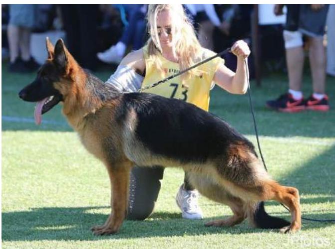
PUPPY DOG Cathie, Lynch & Lubbock SABARANBURG ROLEX