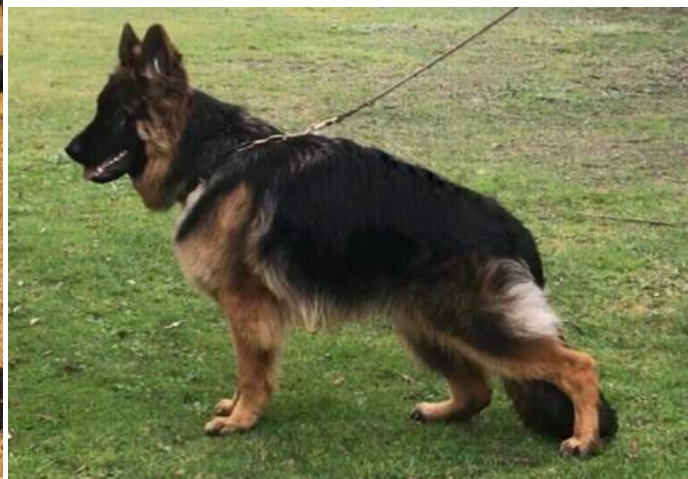
MINOR PUPPY DOG LSH S Bick JAYSHELL SKYFALL