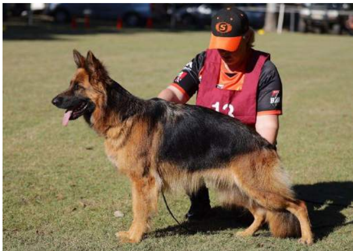
INTERMEDIATE BITCH LSH