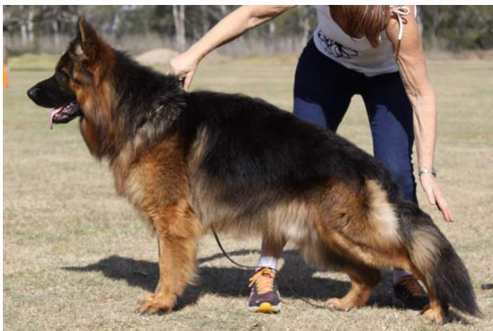
INTERMEDIATE DOG LSH