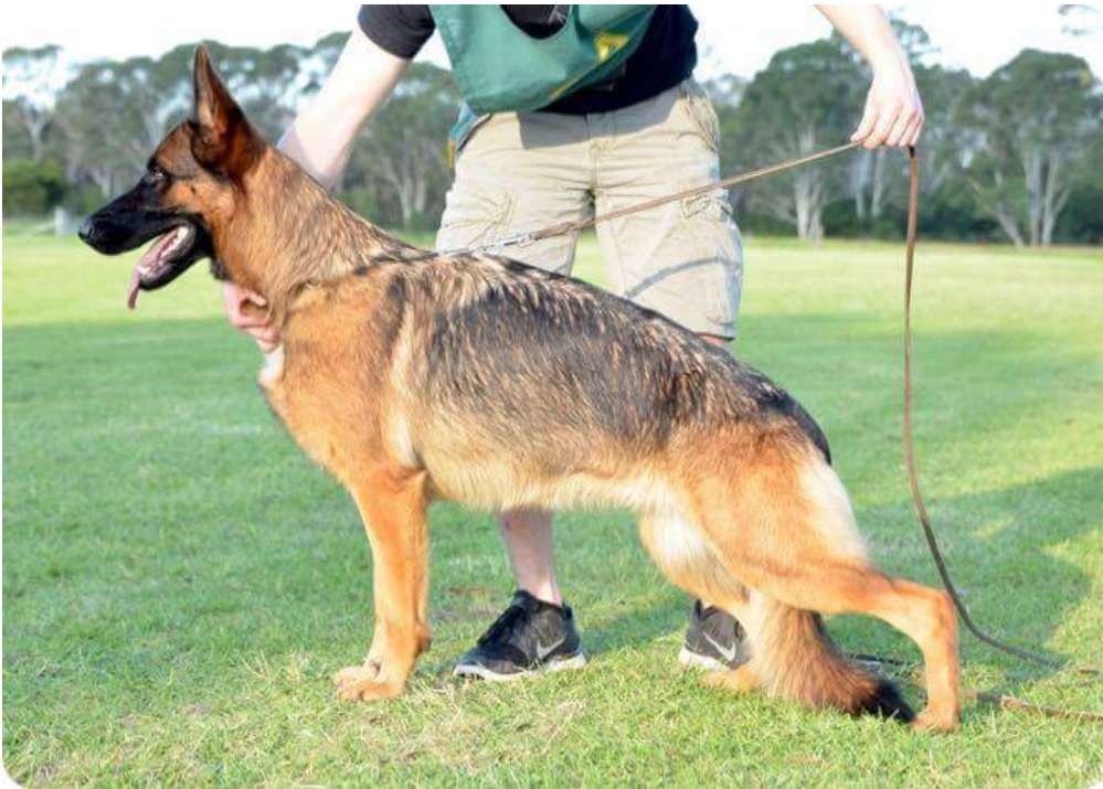
RES SIEGERIN EX MERIT 2 *Ch VLADIMIR GREYS THE NEW BLACK AZ (Owners – G & K Morton)

(23 animals entered in the open classes which included gun testing and off lead gaiting – 19 presented – 6 awarded the highest grade possible 'Excellent Merit' – 10 excellent - 2 very good and 1 ungraded) (8 sires progeny groups were entered – 4 of which were presented – VABLO FREDDIE DJAMBO AND GERRY)