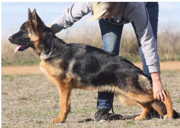
BABY PUPPY BITCH M & C Theris BOSSFACE BOOM BOOM BABYH