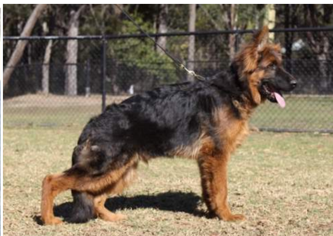
BABY PUPPY DOG LSH G & K Stevenson SUNDANEKA RIO GRANDE

(35 LSHs entered – 15 males/20 females – A total of 7 absent – and did you know that the first time a LSH Sire presented a progeny group in Australia it was at a NSW SBE? - 2015 Sundaneka True Blue)