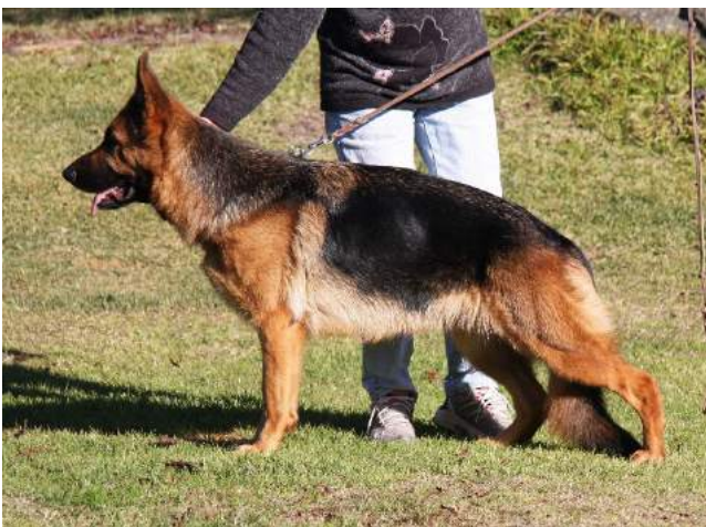
FEMALE ADULT JOINT WINNER *LAWINE TAKIERA