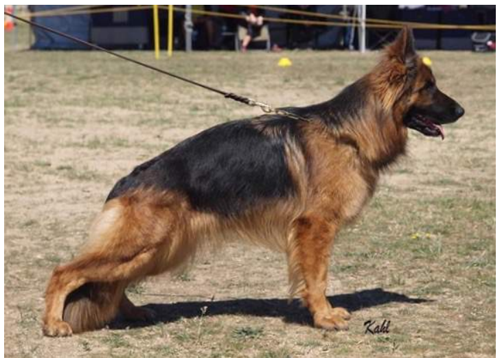
ADULT FEMALE LSH WINNER *JAKNELL RUBY TUESDAY