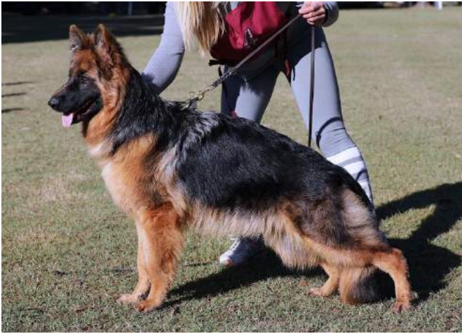
PUPPY BITCH LSH WINNER CRYTARA PINK SOX