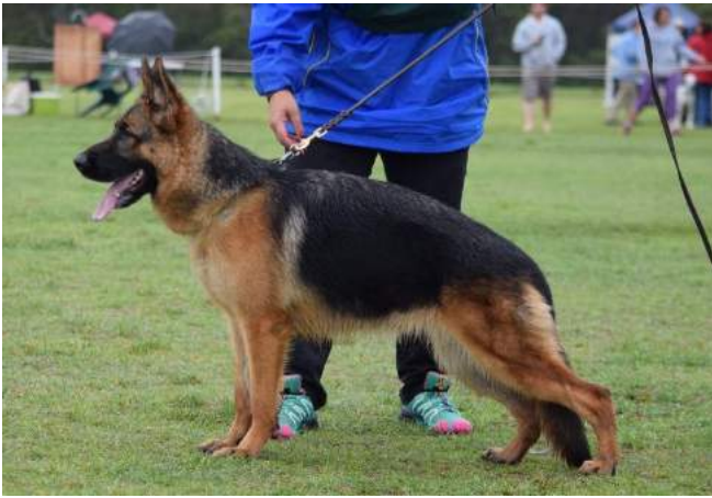
PUPPY BITCH WINNER CINDERHOF BELLATRIX