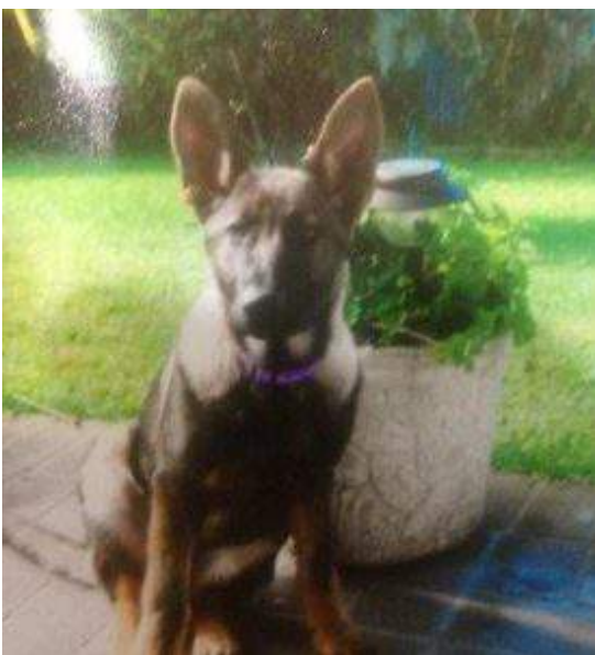
OBEDIENCE O Ch SINGHA GREY MIST UDX