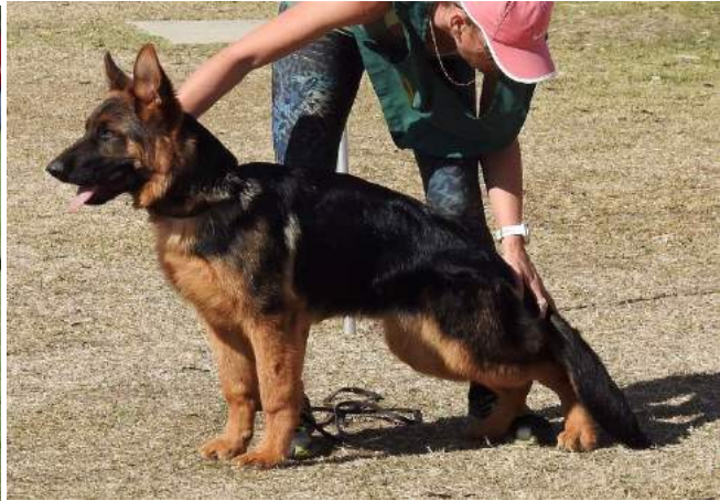
PUPPY DOG WINNER HAUSILLEVON REY