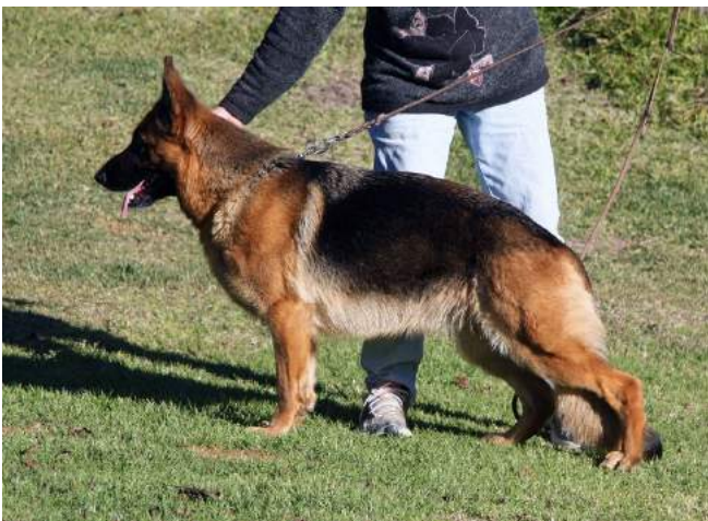
FEMALE ADULT JOINT WINNER *ANDACHT GYPSY MOTH