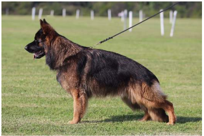
ADULT MALE LSH WINNER *SIOBAHN GREYT IMPACT