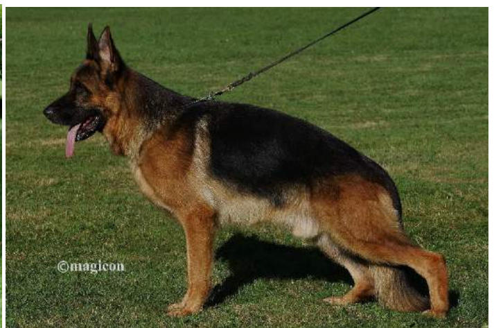
SIRES PROGENY *TOBY V D PLASSENBURG (Deu) Aed