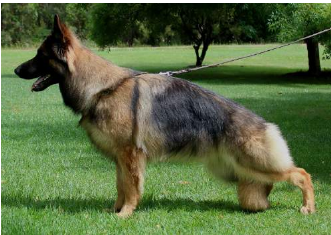
DAMS PROGENY *SIOBAHN GREYT SENSATION AZ