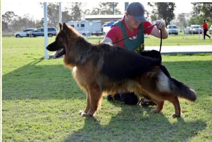
PUPPY DOG LSH WINNER KUIRAU ORLANDO