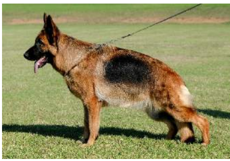
BRONZE – LILY