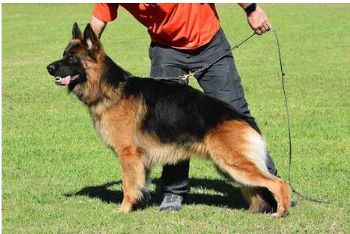
INTERMEDIATE LSH MALE, INTERMEDIATE IN BREED CONKASHA DESERT COBRA, INTERMEDIATE IN SHOW