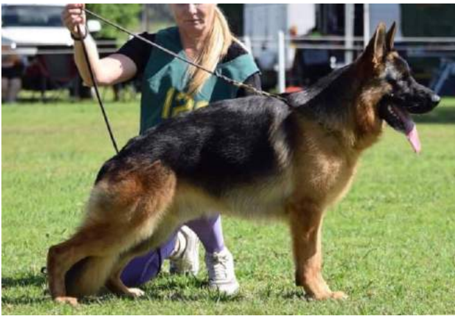
JUNIOR DOG JAKNELL WORTH THE WAIT