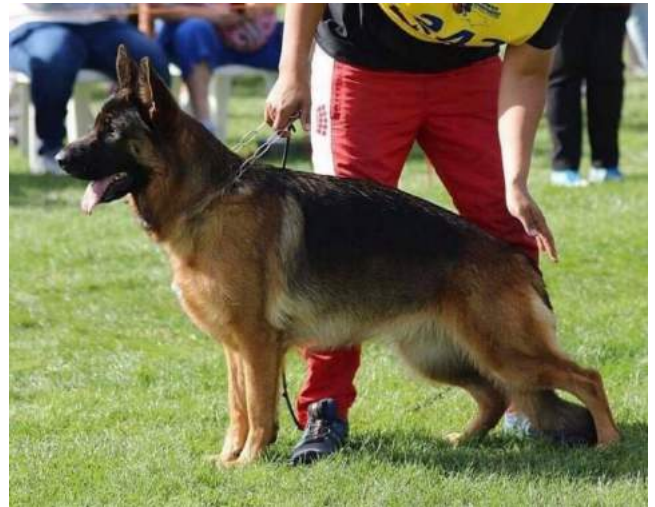
INTERMEDIATE BITCH SADRIA NELLY