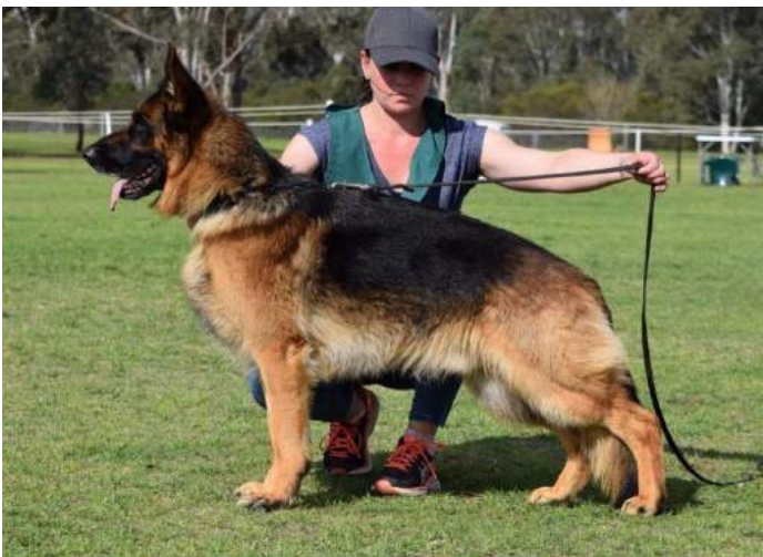
INTERMEDIATE DOG INTERMEDIATE IN BREED UHLMSDORF BLACK DIAMOND