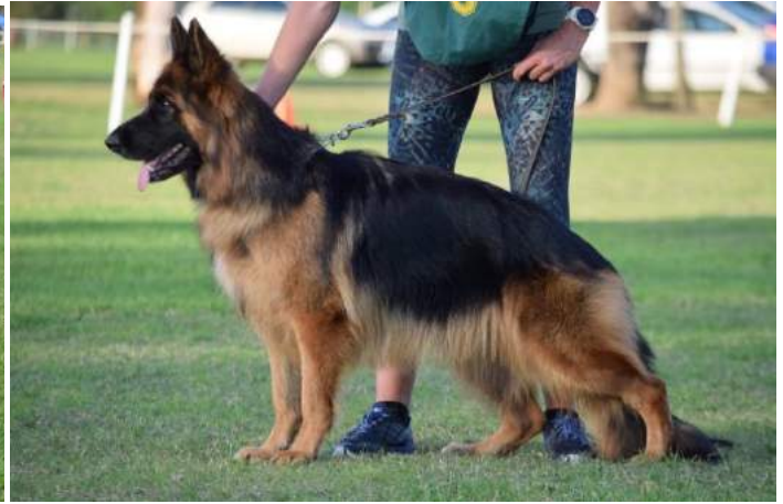
JUNIOR LSH FEMALE CRYPTARA WHATS THE CATCH