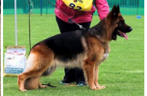
BRONZE – EMMA

(Registration names of the medal winners can be found in the role of honour!)