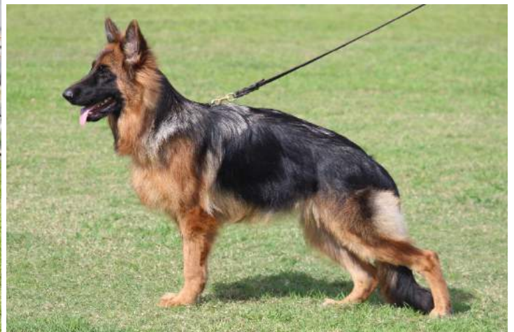
MINOR LSH FEMALE, MINOR IN BREED CRYTARA TUDOR ROSE