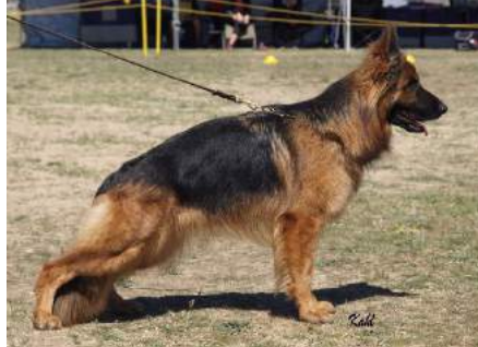
SILVER – RUBY