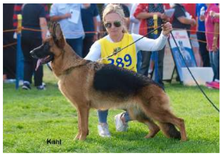
SILVER – HAVOC