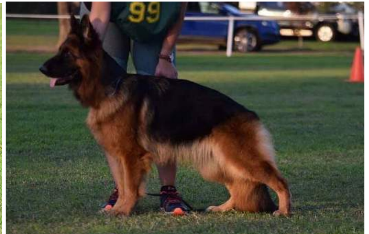
INTERMEDIATE LSH FEMALE LINDENHELM FANCY TICKLED PINK