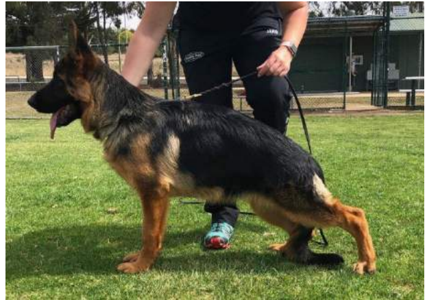
BABY FEMALE BABY IN BREED SADRIA WHAT A STORM, BABY IN SHOW