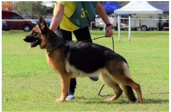
JUNIOR BITCH JUNIOR IN BREED UNSHAUS DJAMINKA