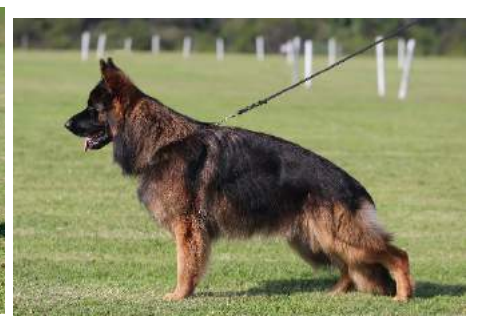
BRONZE - APOLLO