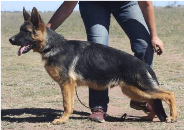
BABY MALE BOSSFACE TRICKY