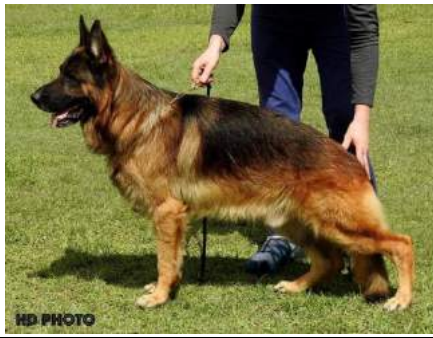
SILVER – OLLIE