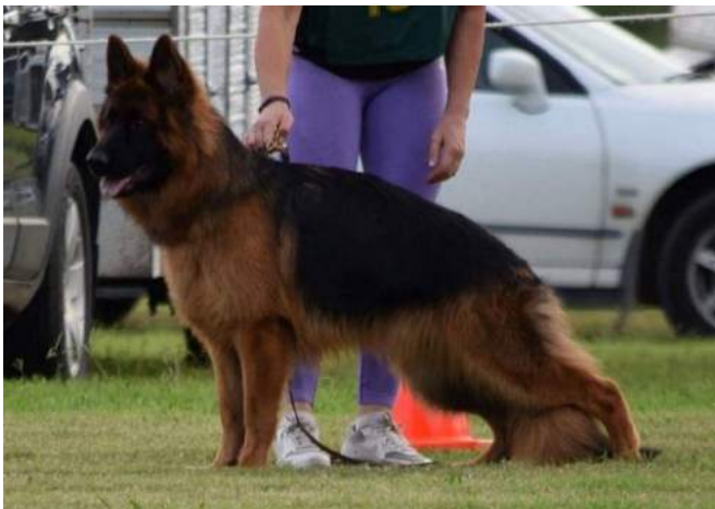
PUPPY LSH MALE DERHARV THE FORCE IS STRONG