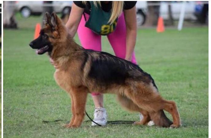
BABY LSH FEMALE DERHARV GOLD EDITION