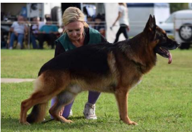
OPEN DOG OPEN IN BREED, OPEN IN SHOW