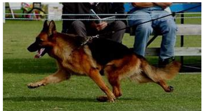
OPEN BITCH JAYSTRYKE STUNNING IN GOLD