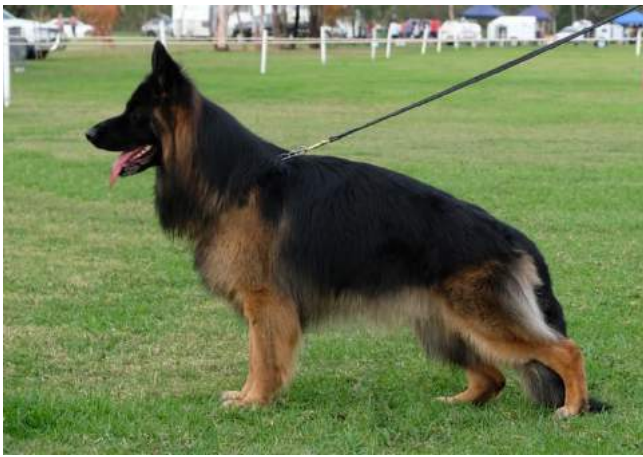
JUNIOR LSH MALE JUNIOR IN BREED EROICA ICE ICE BABY, JUNIOR IN SHOW