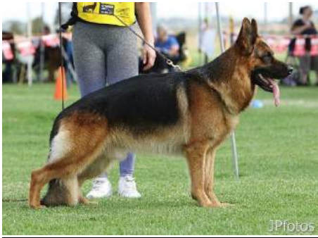
GOLD – MACHO

Below are the nine GSDL NSW owned Medalists for 2019! Followed by a role of honour for all podium place getters at the 2019 national show and trial owned or bred by members.