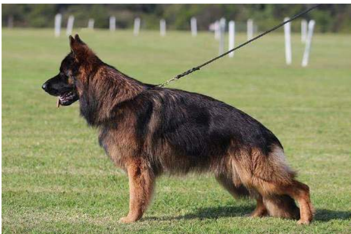
OPEN LSH MALE OPEN IN BREED SIOBAHN GREYT TEMPTATION RUNNER UP BIS