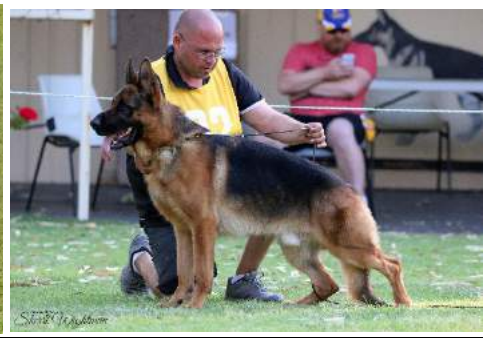
BRONZE – HANNIBAL