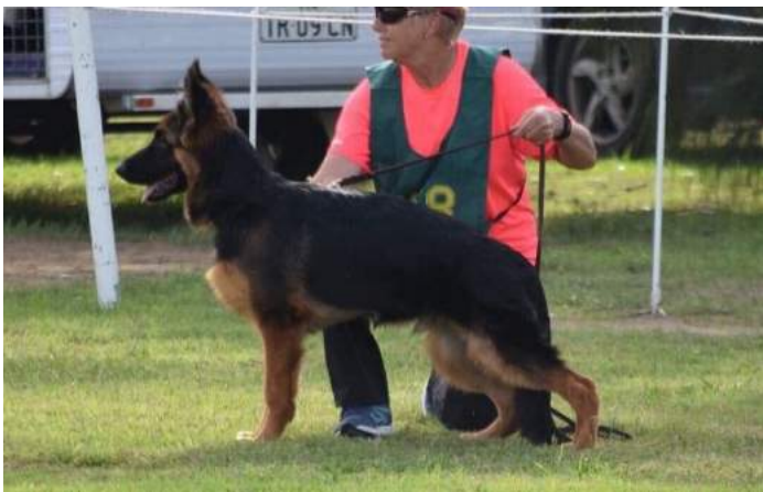
BABY LSH MALE BABY IN BREED TRAYKEN JESSIE JAMES