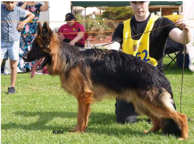
MINOR LSH MALE BHUACHAILLE EVANDER