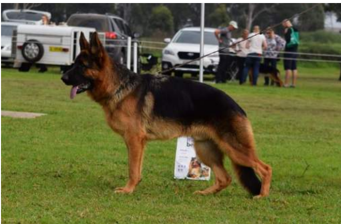
PUPPY MALE PUPPY IN BREED BABANGA VIN DIESEL