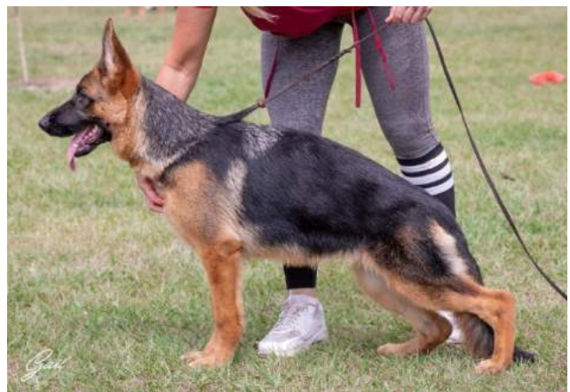
MINOR FEMALE MINOR IN BREED CINDERHOF ITALIAA, MINOR IN SHOW