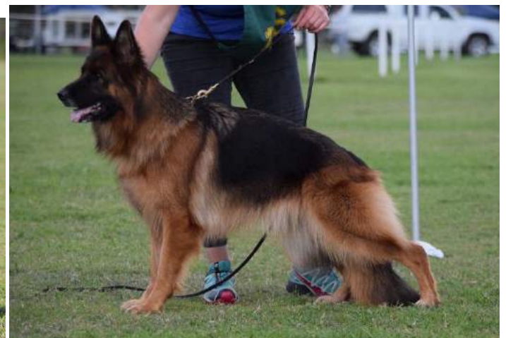
OPEN LSH FEMALE FREMONT WILDEST DREAMS

DOG CHALLENGE : SIOBAHN GREYT TEMPTATION DOG RES CHALLENGE : EROICA ICE ICE BABY BITCH CHALLENGE : FREMONT WILDEST DREAMS BITCH RES CHALLENGE : LINDENHELM FANCY TICKED PINK