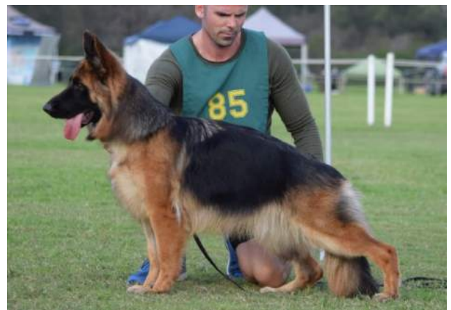
PUPPY FEMALE KINGVALE MAXIMUM IMPACT