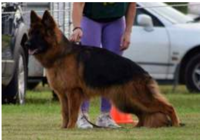
JUNIOR LSH MALE DERHARV THE FORCE IS STRONG