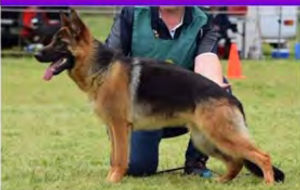
Puppy BiB NO 41 stobar ghanaa