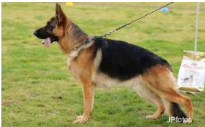
JUNIOR DOG ZANDRAC JAGUAR