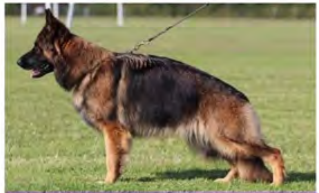
Open siobahn greyt temptation