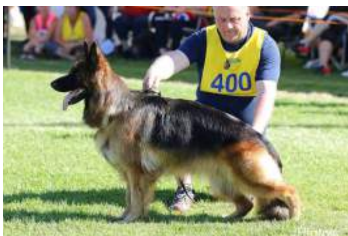
OPEN LSH FEMALE EX MERIT 1 SIEGERIN *CH EROICA DUCHESS OF YORK AZ

2018/19 GSDL POINTSCORE FINAL RESULTS (top FIVE places as at end October)