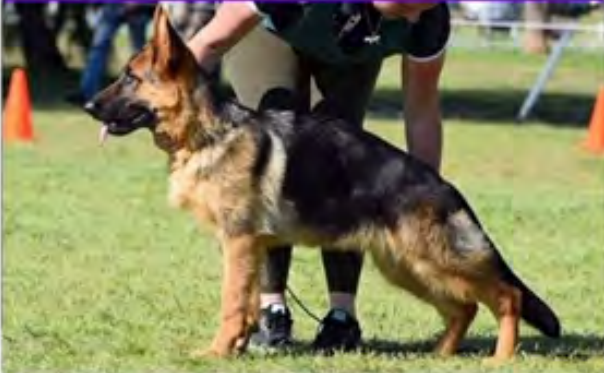
MINOR BiB NO:37 KINGLAND HARRIET