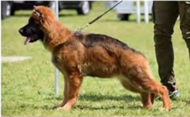
Baby siobahn greyt expectation