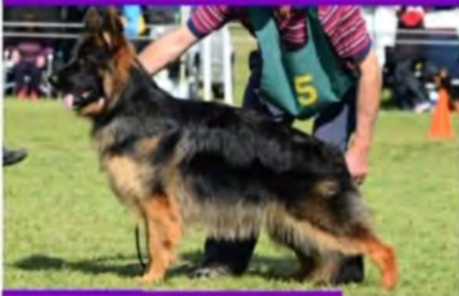
Puppy BIB NO: 5 dellahund party at my place