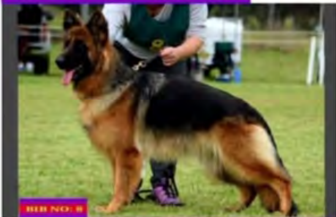
BIB NO: 8