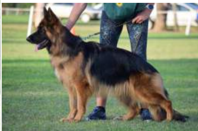
INTERMEDIATE LSH FEMALE CRYTARA WHATS THE CATCH