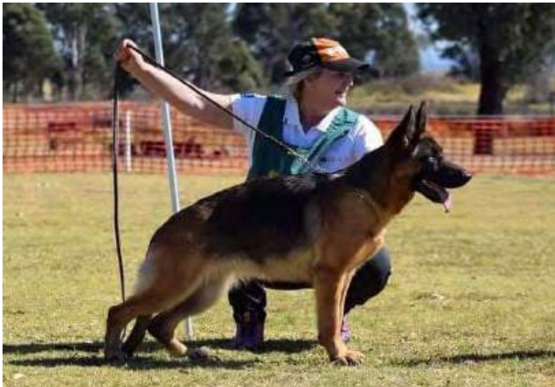
RES SIEGERIN EX MERIT 2 *CINDERHOF VANTAA AZ (Owners – Lynch/Cathie)

25 animals presented in the open classes which included gun testing and off lead gaiting – 6 awarded the highest grade possible 'Excellent Merit' – all others graded excellent