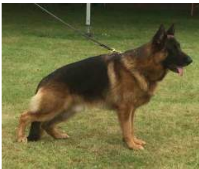
OPEN DOG EX MERIT 1 SIEGER UK CH CONBHAIREAN FREDDIE IPO2 KKL LBZ