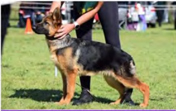
Baby bossface killing me softly