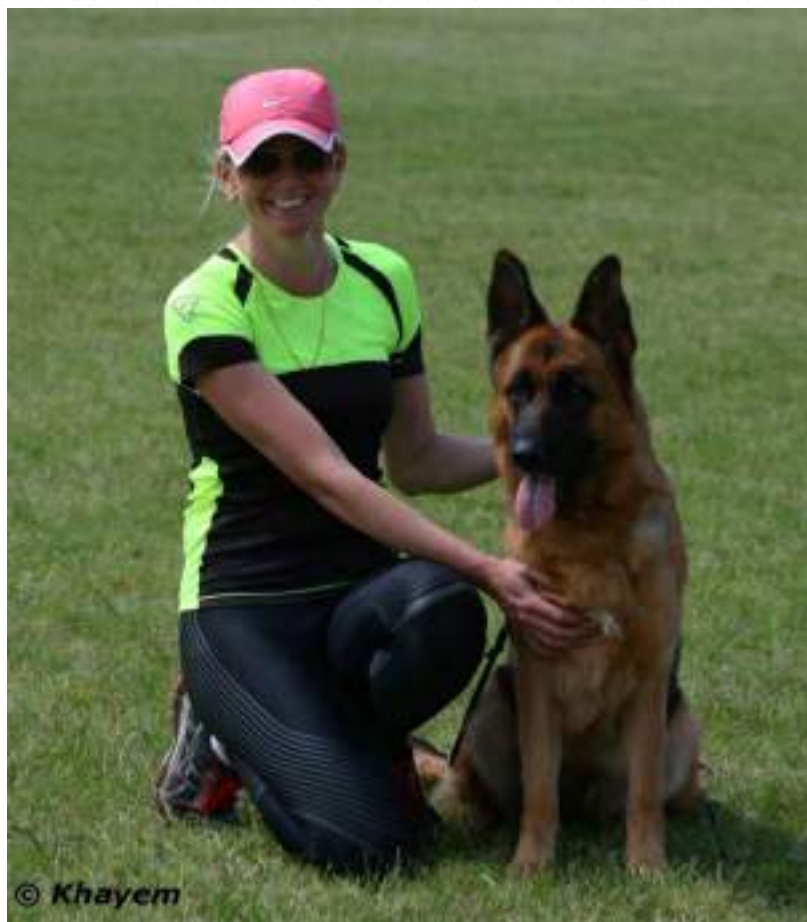
EX MERIT 3 *ANDACHT GYPSY MOTH AZ (Owners – P & D Smith)

25 animals presented in the open classes which included gun testing and off lead gaiting – 6 awarded the highest grade possible 'Excellent Merit' – all others graded excellent