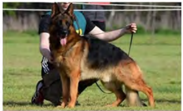
open bib no: 92 uhlsdorf jacks black