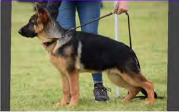
Baby BiB NO: 30 cossavane dream tb famous