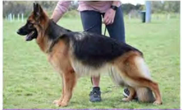
Int kuirau olivia