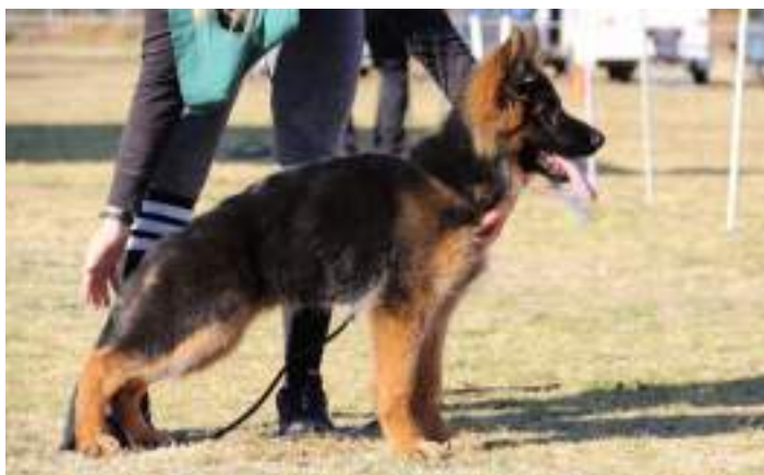
BABY LSH FEMALE KARABACH QUITE A SKYWALKER