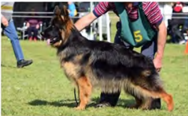
Puppy dellahund party at my place