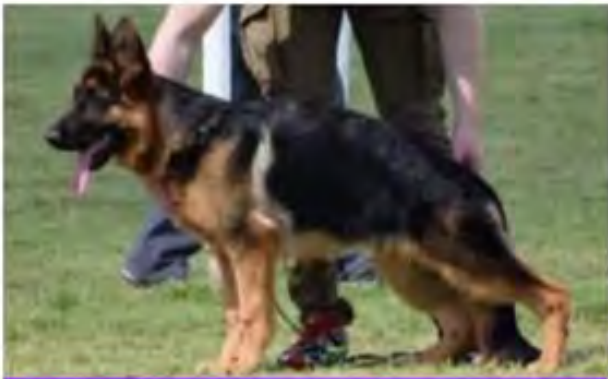
baby bib no: 67 kaygarr dark knight