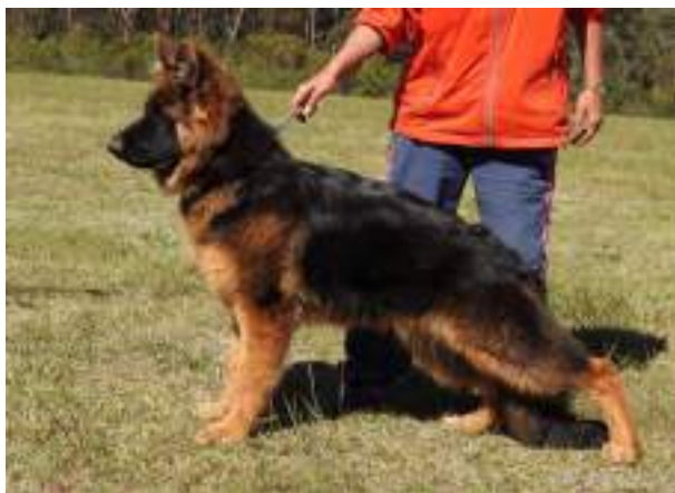
BABY LSH MALE KINGVALE EYE OF THE TIGER