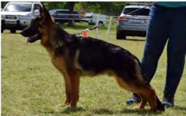
minor bib no: 71 kingland harco