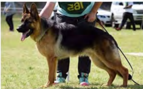
puppy bib no: 74 kuirau riccardo