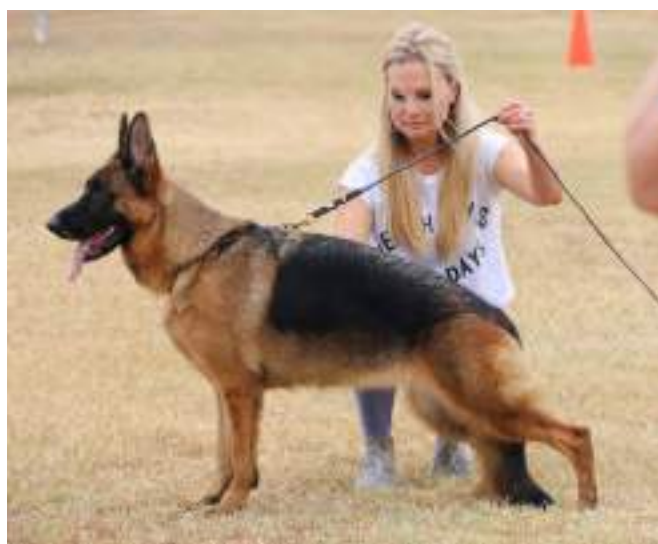
OPEN BITCH EX MERIT 1 SIEGERIN *FREINHAUF HAVOC AZ