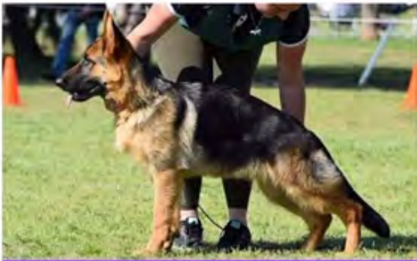
Minor kingland Harriet