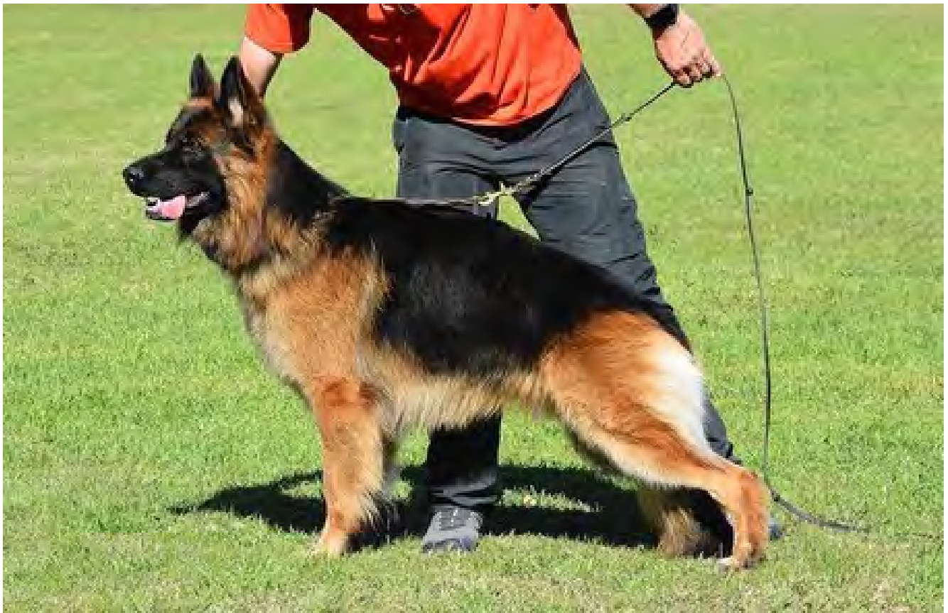
RES SIEGER EX MERIT 2 *CONKASHA DESERT COBRA AZ (Owners – T Devin)

(4 sires progeny groups were presented – same ones as 2018! - VABLO FREDDIE DJAMBO AND GERRY)