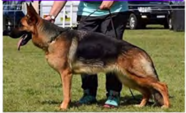
Jr BiB NO: 40 khanique nadalia