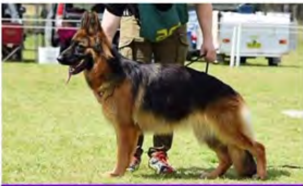
Jr Vladimir once you go black