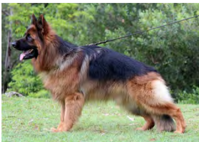
INTERMEDIATE LSH MALE KUIRAU ORLANDO