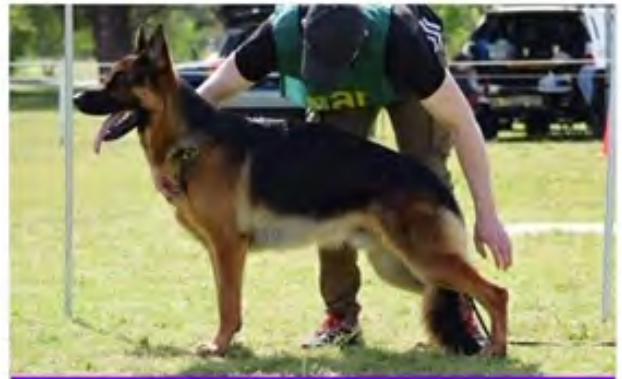
Jr bib no: 78 sheznova djando