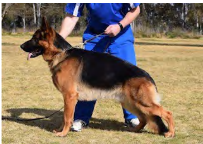
INTERMEDIATE DOG NIKOBISHUNDE HAAKON AZ