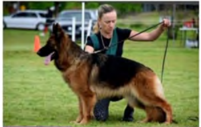
Int BIB NO: 10 lindeneime fancy tickeld pink