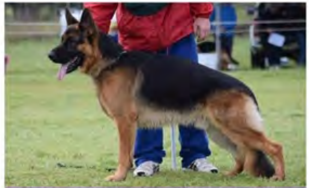
int bib no:100 nikobishund haakon