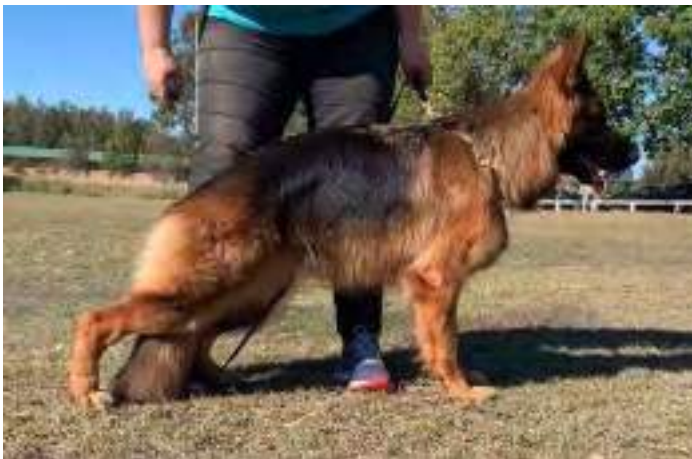
JUNIOR LSH FEMALE GABMALU ECHO