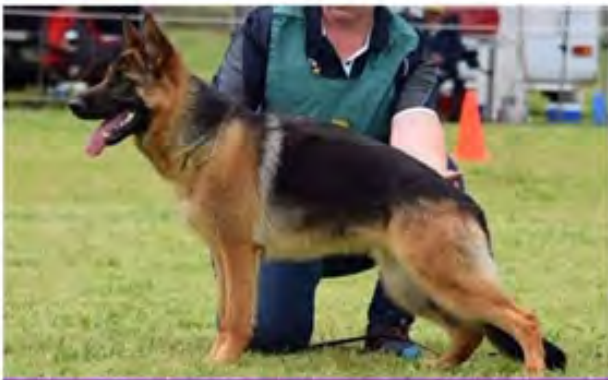
Puppy stobar ghanaa