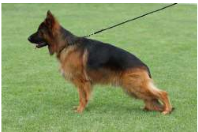
OPEN LSH MALE EX MERIT 1 SIEGER *KARABACH NIGHT FORCE AZ