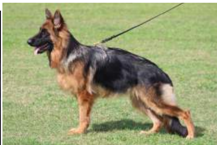
PUPPY LSH FEMALE CRYTARA TUDOR ROSE