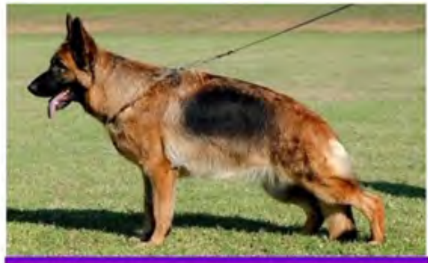
Open vladimir legen waitforit dary

Don't forget that you can advertise your kennel – your stud dog – your wins or any other news in a full page colour advert in Shepherd news for just $40 Contact the Shepherd News editor for assistance with this!