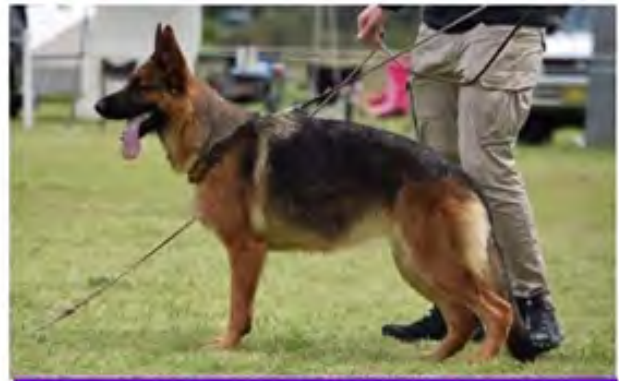
Int vladimir me me im first