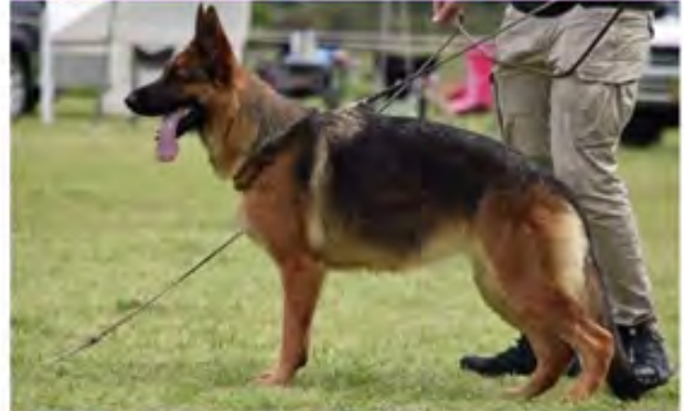
Int BiB NO: 54 vladimir me me i first