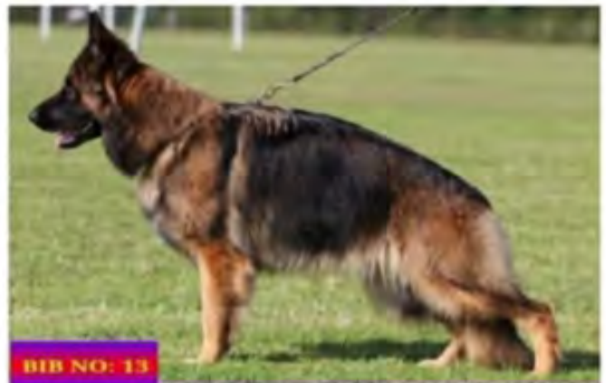
BIB NO: 13