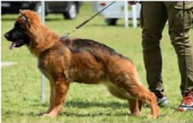
Baby BIB NO: 3 siobahn greyt expectation

She has sent us the following collections of class winner pics!