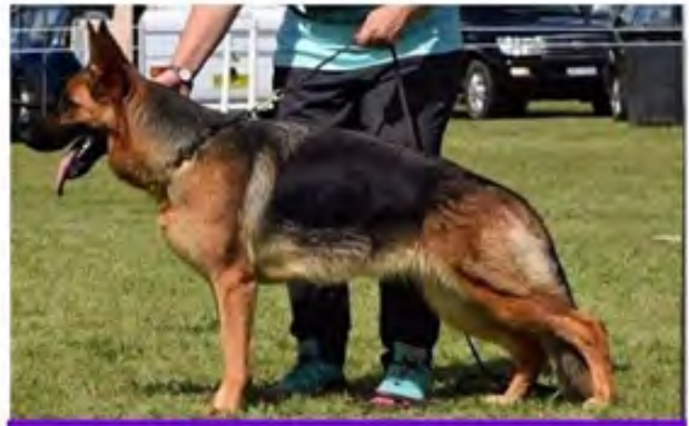
Jr khanique nadalia