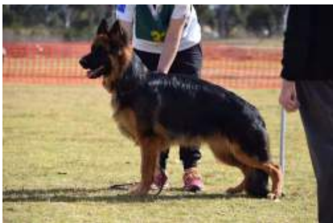
PUPPY LSH MALE TRAYKEN JESSE JAMES