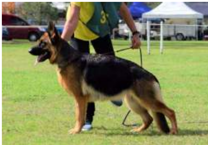
INTERMEDIATE BITCH UNSHAUS DJAMINKA AZ