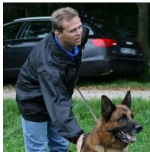
VA1 Pakros d'Ulmental