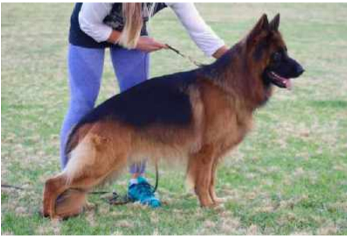
RES Challenge LSC Dog – Derharv The Force Is Strong