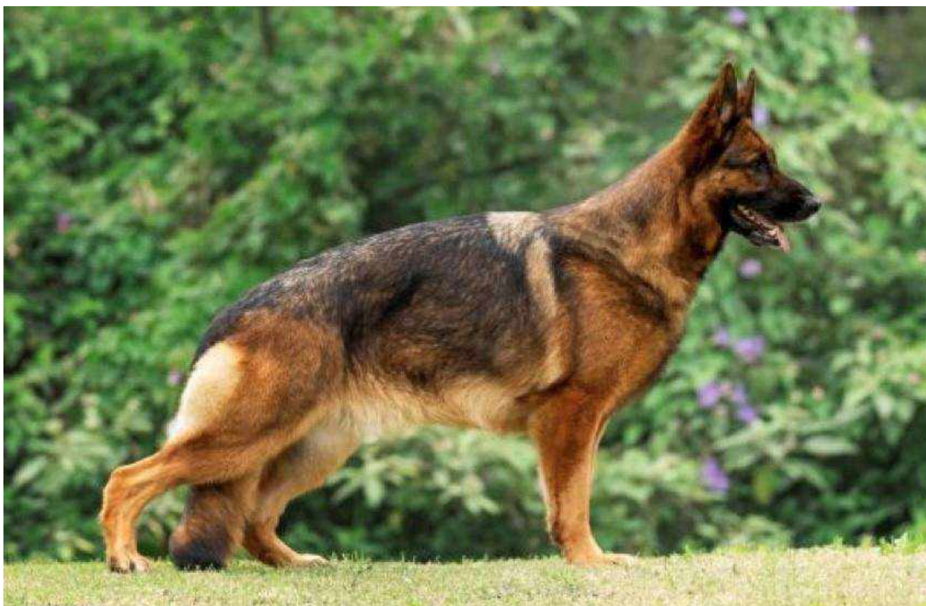
Bitch Challenge winner – league Easter Ch Show - *Ch VLADIMIR MIMI IM FIRST AZ