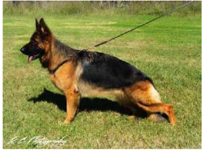
RES Challenge SC bitch – Sadria What A Storm