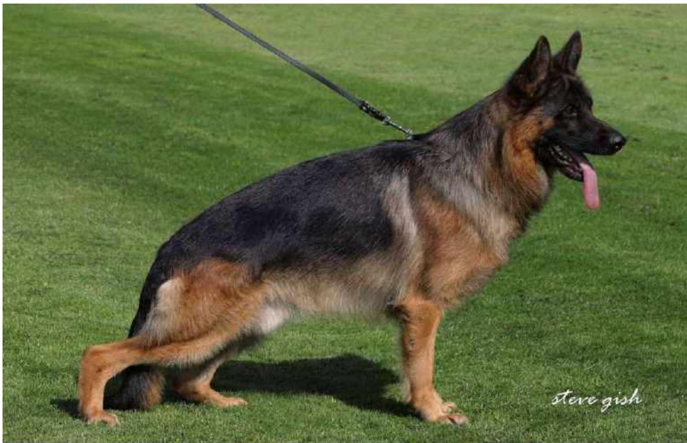
Dog Challenge winner - League Easter Ch Show – *OLYMP V LARCHENHAIN imp