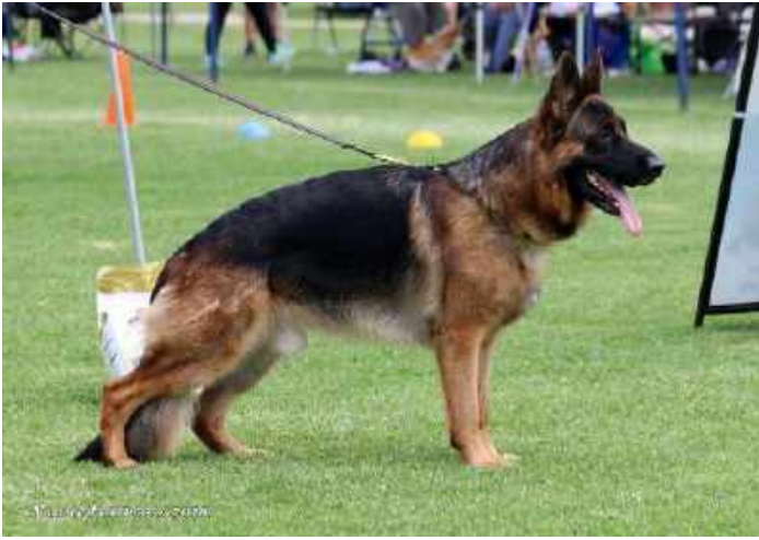
RES Challenge SC Dog – Uhlmsdorf Jack Black