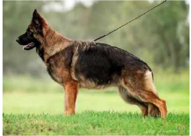
RES Challenge LSC bitch – Siobahn Greyt Expectations