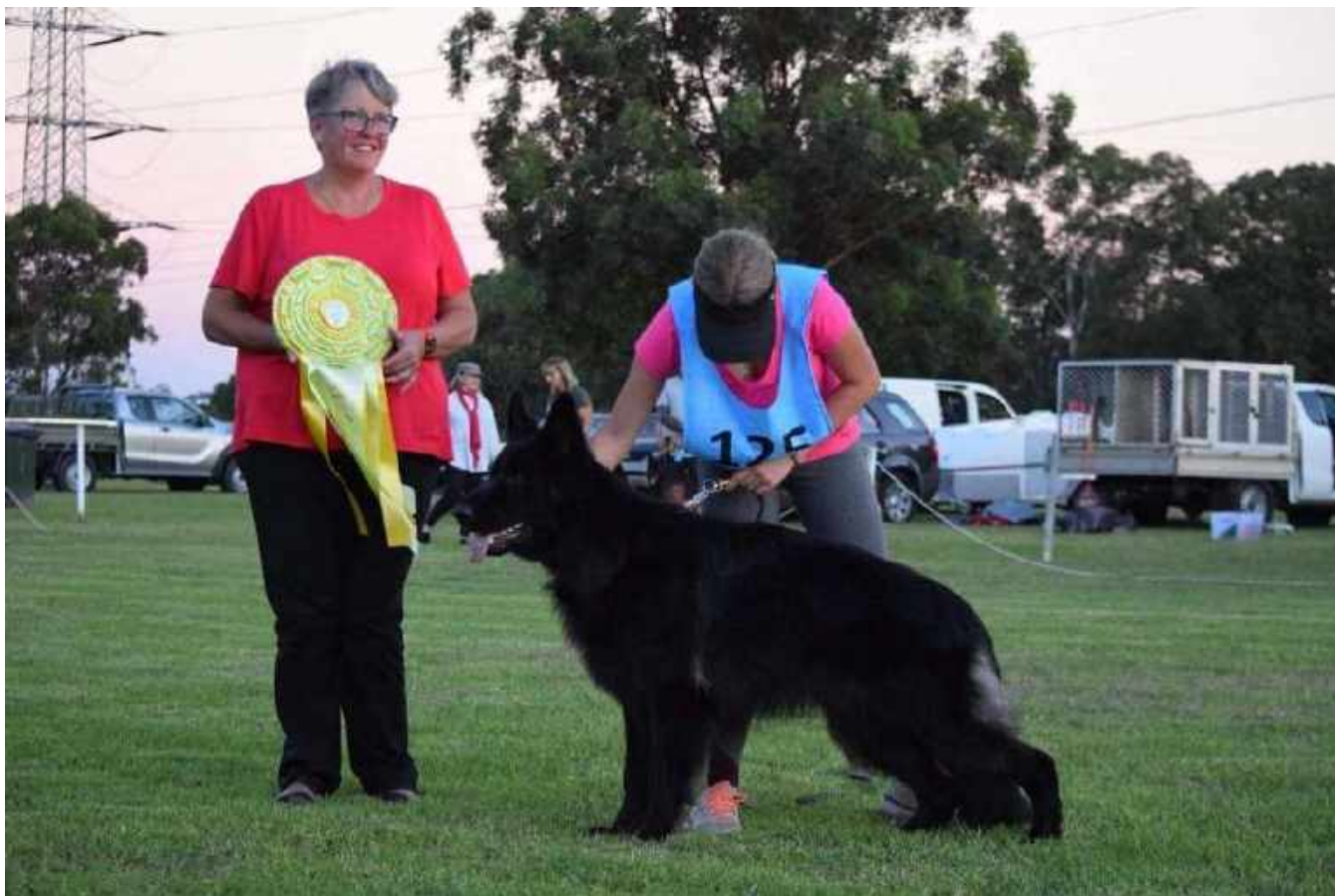
Dog Challenge winner – league Easter Ch Show – LETTLAND FLINT