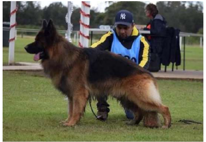
Open LC Dog Silas vom Wierlings Hook