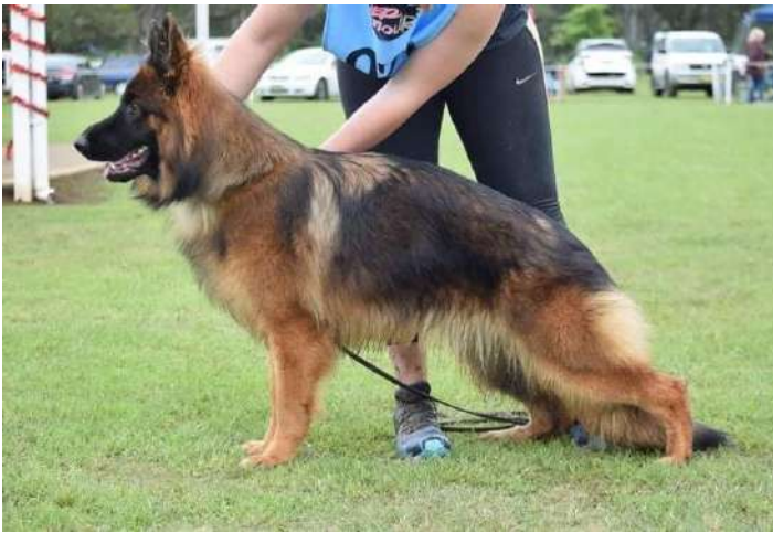
Puppy LC Bitch Azincourt Miss Dior