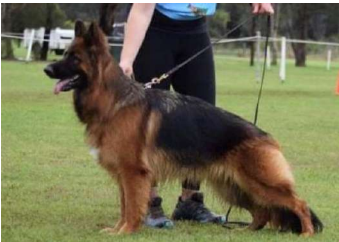
Intermediate LC Bitch Eroica Nova AZ BEST LC BITCH