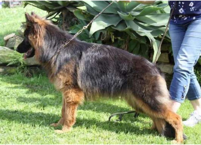
Minor LC Dog Sundaneka Dascha