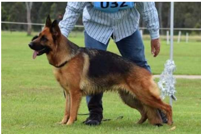
Intermediate Bitch Randinka Honeysuckle