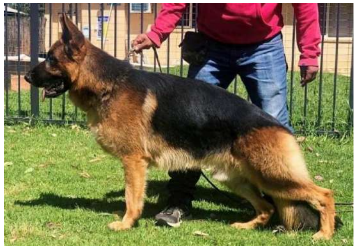
2 nd Open Dog Aimsway Mugshot AZ