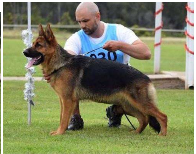
Junior Bitch Vonderanden Aria