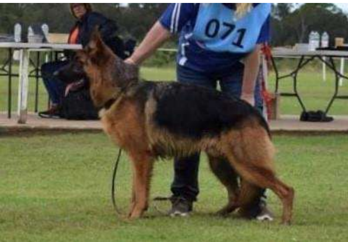
Puppy Dog Pamakay Yahoo Serious