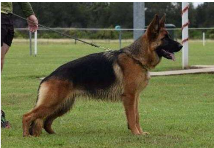
Puppy Bitch Vladimir Supercalifragelistic