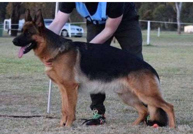
Intermediate Dog *Sheznova Luca AZ