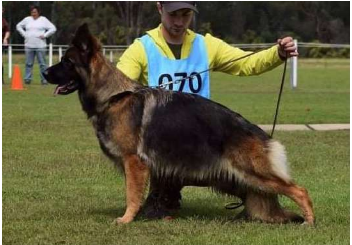
Open LC Bitch Siobahn Greyt Expectations RESERVE BEST LC BITCH