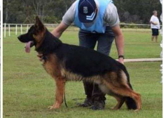
Junior Dog Cinderhof Raffaa AZ