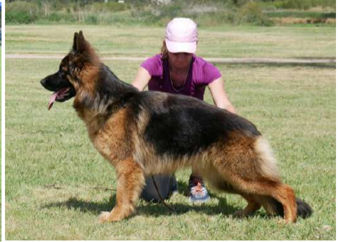
Junior LC Bitch Lawine Pleiades AZ