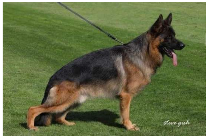
Open Dog *Olymp vom Larchenhain