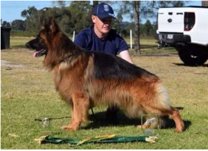
2 nd Open LC Dog Kuirau Orlando