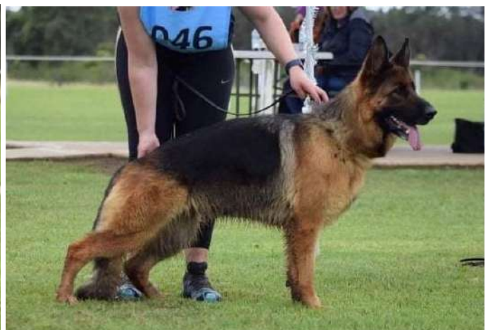
Open Bitch Sadria What A Storm