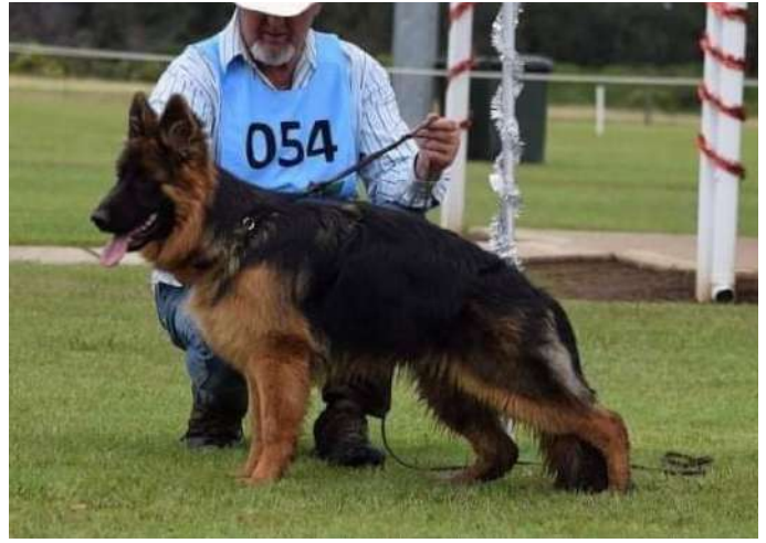
Minor LC Bitch Randinka Typhoon Tess