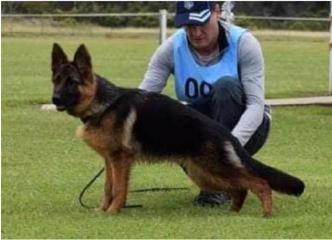
Baby Bitch Kuirau Willow