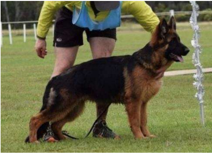
Baby LC Bitch Vladimir The Bees Knees