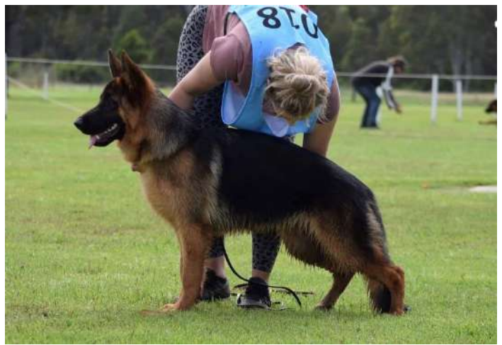
Minor Bitch Kelpinpark Vientetta